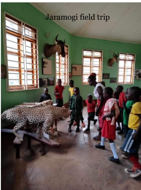
Jaramogi field trip