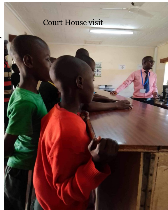
Court House visit